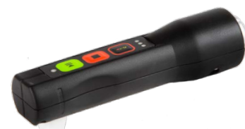
Pencil Probe - 90° Transverse