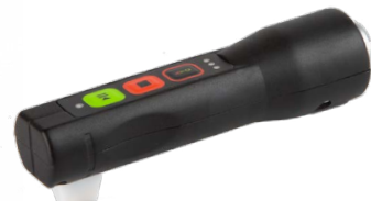
Pencil Probe - 90° Inline