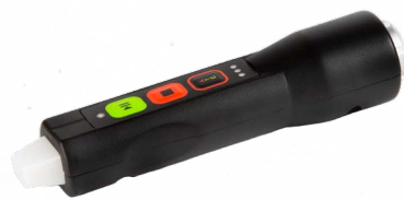
Pencil Probe - Straight